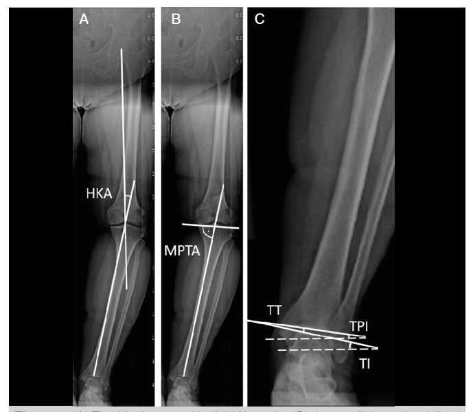
Figure 1. (A) The hip-knee-ankle (HKA) angle, (B) the medial proximal tibial angle (MPTA) and (C) the tibial plafond inclination (TPI), talar inclination (TI), and talar tilt (TT). The dashed line indicates the ground.

Preoperative and postoperative visual analog scale (VAS), short form 36 (SF-36) and ankle-hindfoot scale (AHS) scores of both groups were evaluated and recorded.